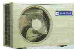
Single Circuit, Single Phase