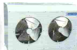
Multi Circuit, Three Phase