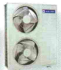
Multi Circuit, Single Phase